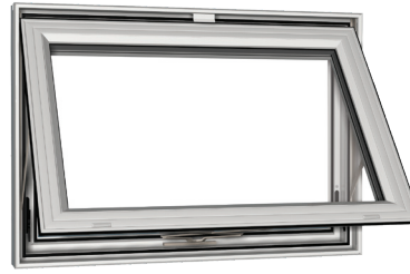
MODEL 8100 (REPLACEMENT)