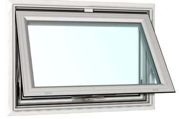
MODEL 9100 (NEW CONSTRUCTION)