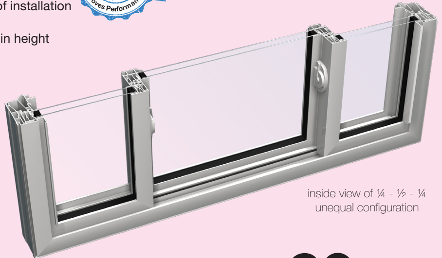
inside view of 1/4 - 1/2 - 1/4 unequal configuration